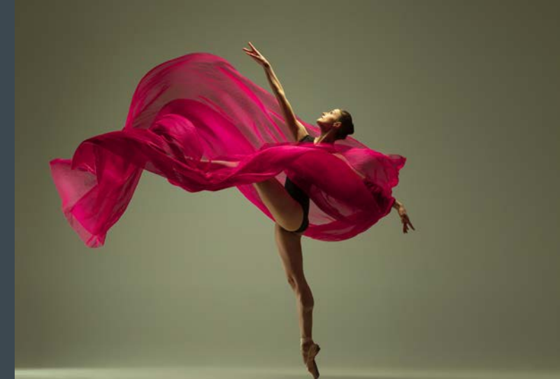
Spectacular performances can be seen at The Lowry, the Printworks, the Palace Theatre and the Manchester Opera House.