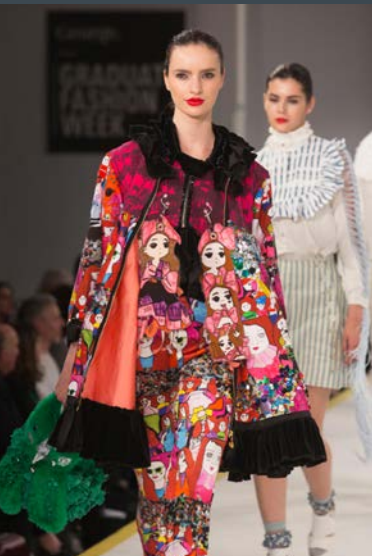
Manchester School of Art during Graduate Fashion Week