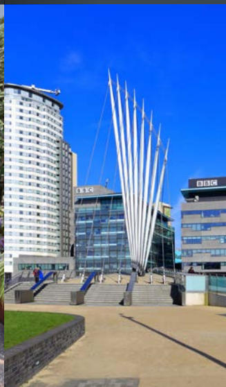
BBC at MediaCityUK in Manchester