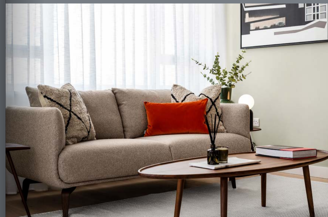
Indicative images of a Lendlease showhome