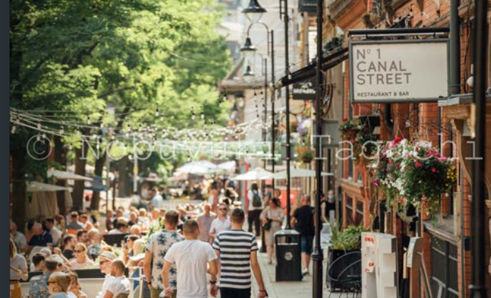
Canal Street and its surrounding bars and restaurants

Manchester is an amazing place to work, live and enjoy. As the largest UK city region economy outside London, it has attracted many major international companies and the numerous universities continue to deliver an outstanding pool of talent.