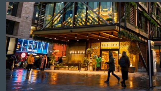
The recently opened The Ivy restaurant, Manchester

The joy of cosmopolitan Castlefield is its engaging contrasts. The quiet of the canals, parks and walkways live comfortably beside the music, the busy bars, the cafes, arts and food that the district has become synonymous with.