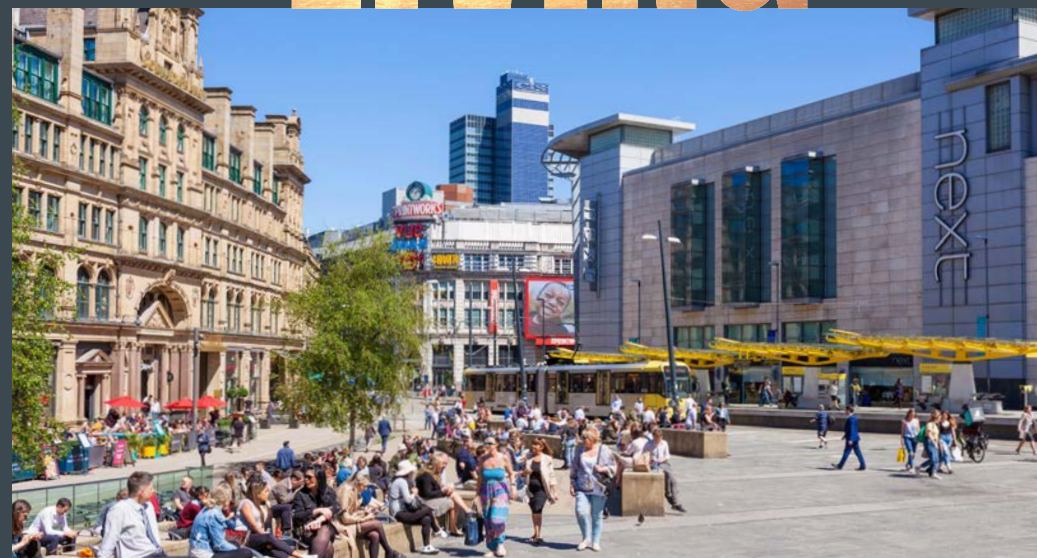
Exchange Square with Arndale Centre

The joy of cosmopolitan Castlefield is its engaging contrasts. The quiet of the canals, parks and walkways live comfortably beside the music, the busy bars, the cafes, arts and food that the district has become synonymous with.