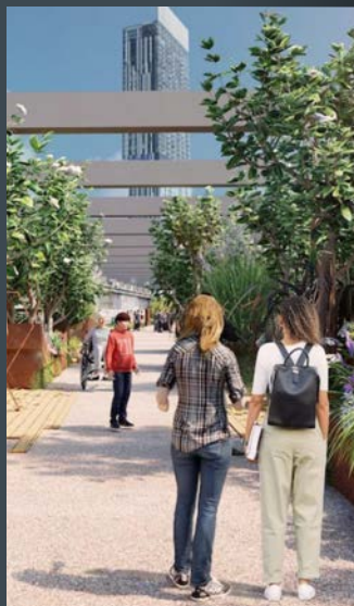
The proposed Castlefield viaduct gardens

You're buying with a trusted global placemaking developer: Lendlease aim to deliver meaningful and enduring places with communities at their heart.