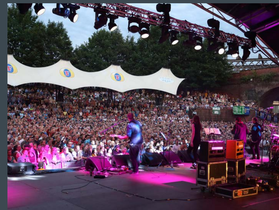
A performance at The Castlefield Bowl