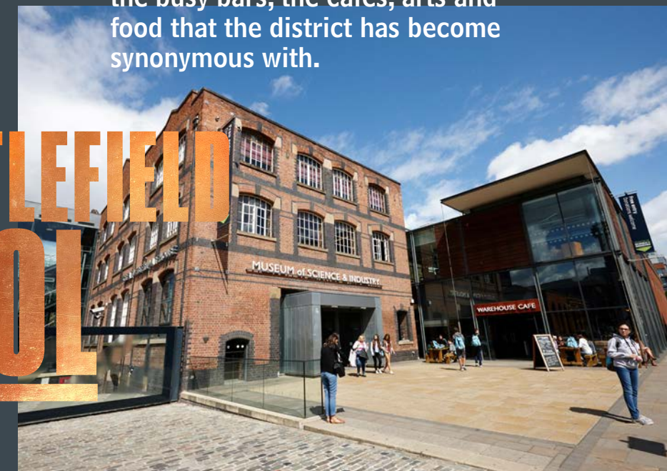
The Museum of Science & Industry